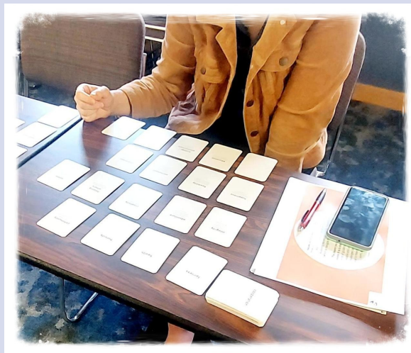
A scholar reflects on her personal values and principles.

Did you miss out on the "Know Your NACE" and "Personal Values and Principles Exploration" workshops?