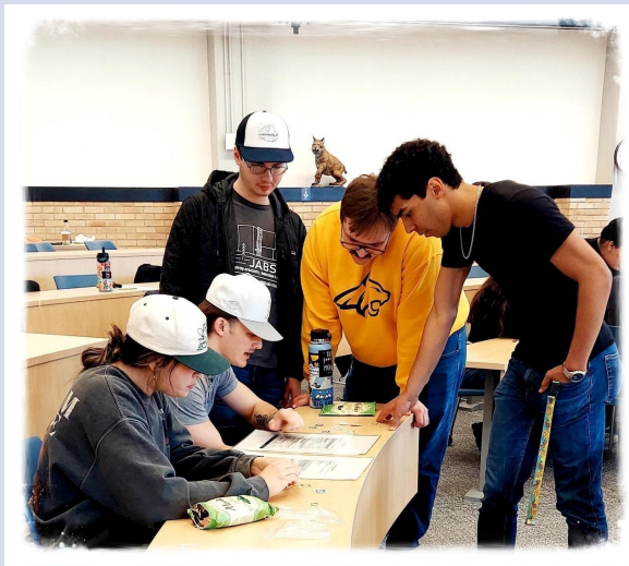
Scholars work together to identify and strengthen their NACE Competencies.