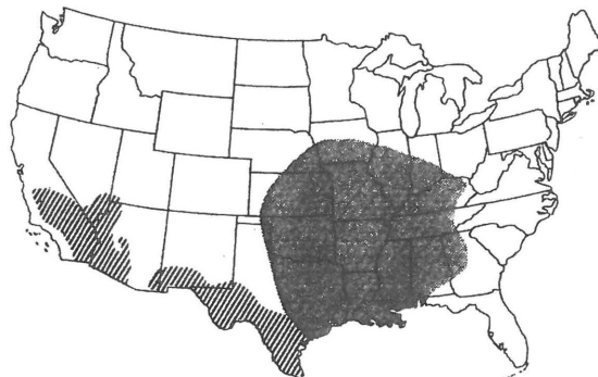
Figure 2 Endemic distributions of the brown recluse (stippling) and related recluse species (lines) in the United States, based on Gertsch and Ennik. 2 Recluse populations become sporadic on either side of the demarcating range borders.