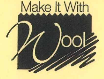
Current National Winners